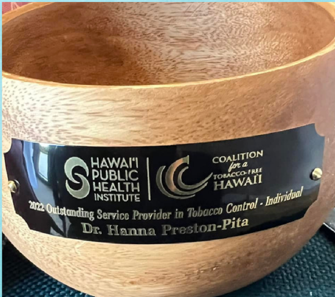
Received 2022 Outstanding Service Provider in Tobacco Control