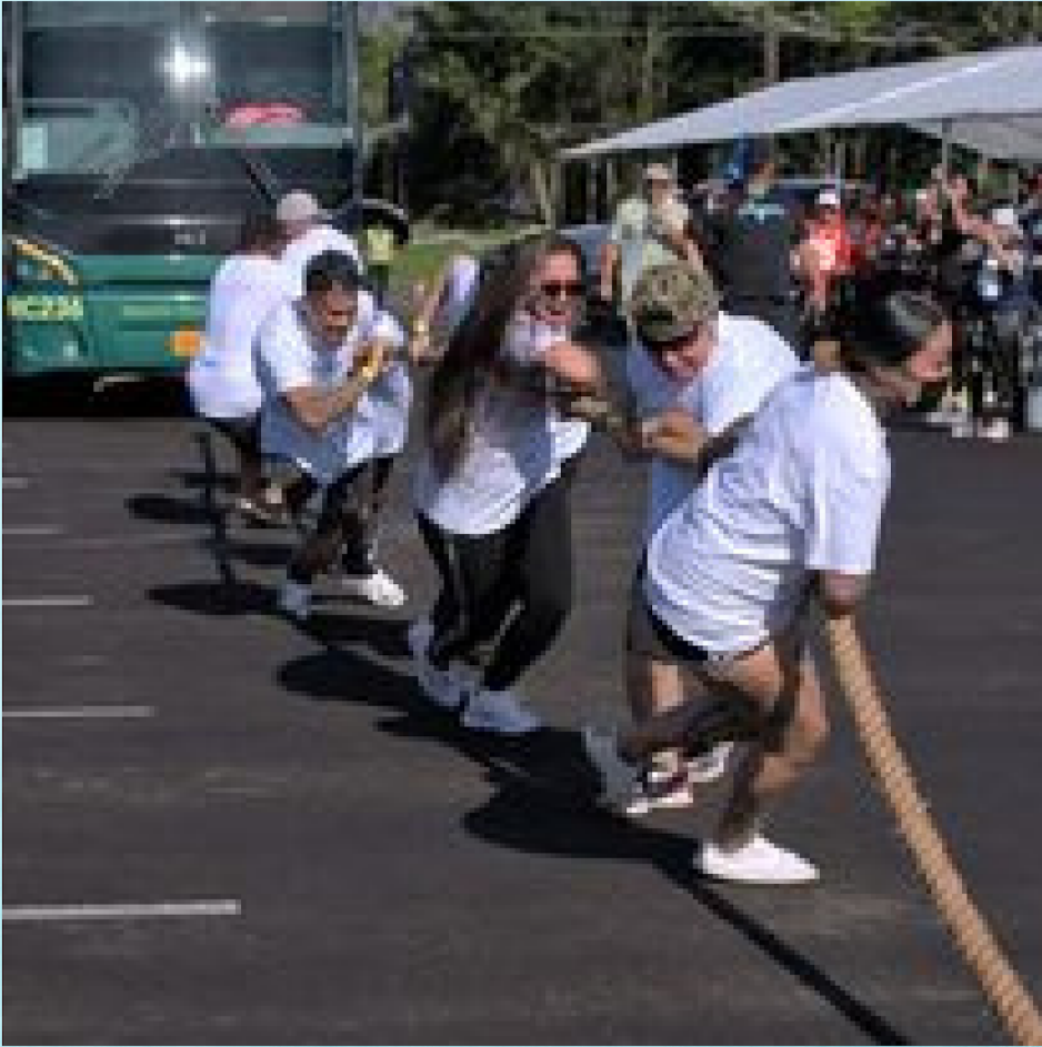
Bus Pull event at BISAC's 8th Annual Summer Jam.