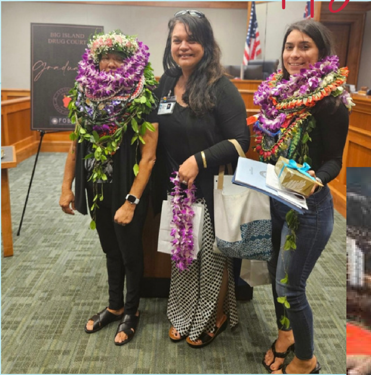
BISAC celebrated one of many Big Island Drug Court Graduations