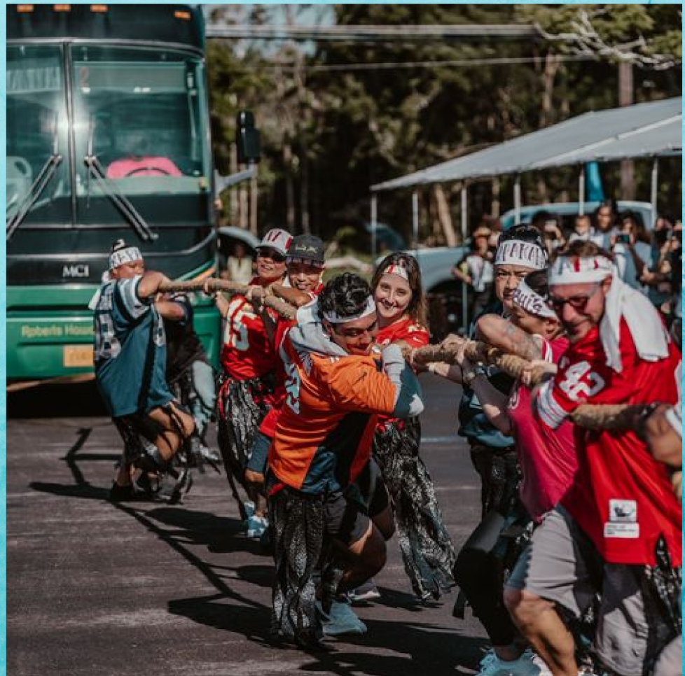
Team BISAC East Hawaii participating in Bull Pull event.