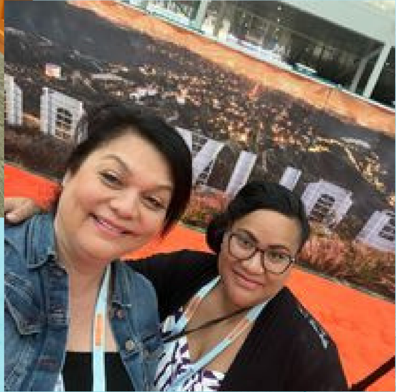
BISAC attended the NATCON 23 conference in California.